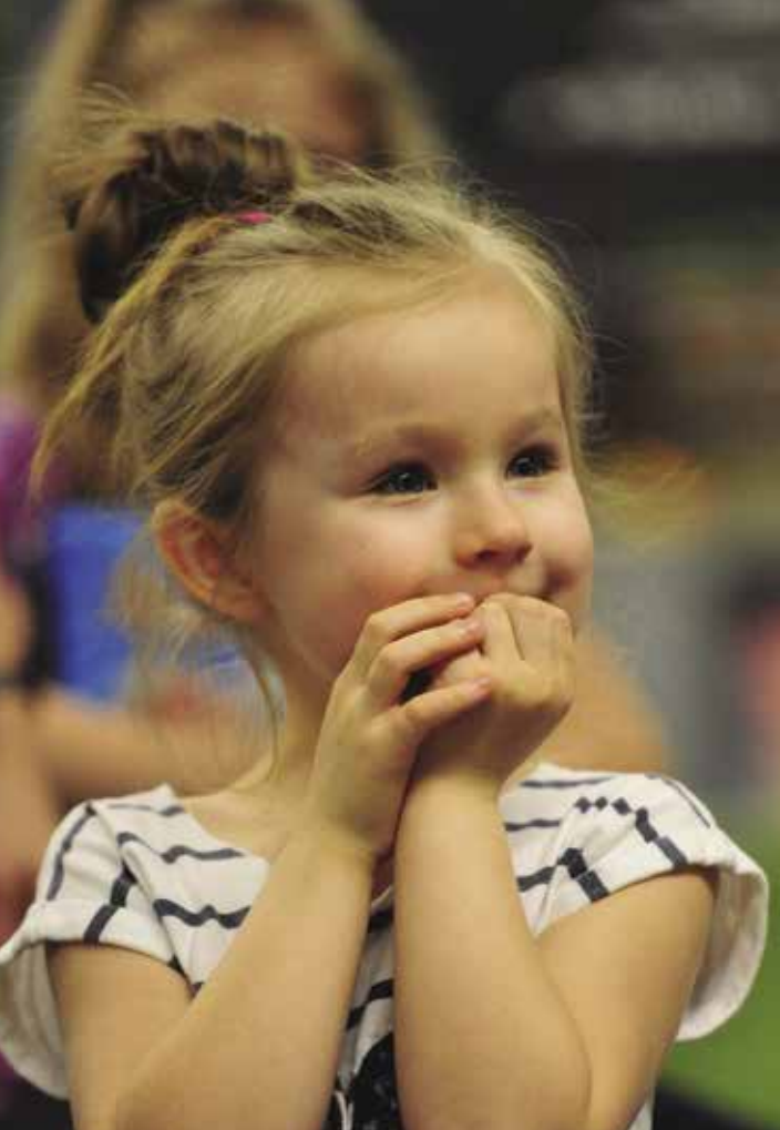
Dream big . . . harness creativity, and through design make the impossible . . . possible.