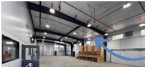
Lynch Advanced Manufacturing Building (Fort Vancouver) - under construction Endeavour Technical Trades Building (Hudson's Bay)