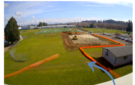
Lynch Advanced Manufacturing Building (Fort Vancouver) - under construction Endeavour Technical Trades Building (Hudson's Bay)